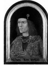
Yon flye bath visage of the Royal Trude family!

Now is the winter of our discontent... Oh well, since we have no Richard III to turn winter to glorious summer, how about spending the next two dreary winter months practicing the Royal Trude? When summer finally comes you will not only have a supply of a distinctive fly, but you may also have won EJTU's Frank B. Hall Memorial Fly Tying contest.