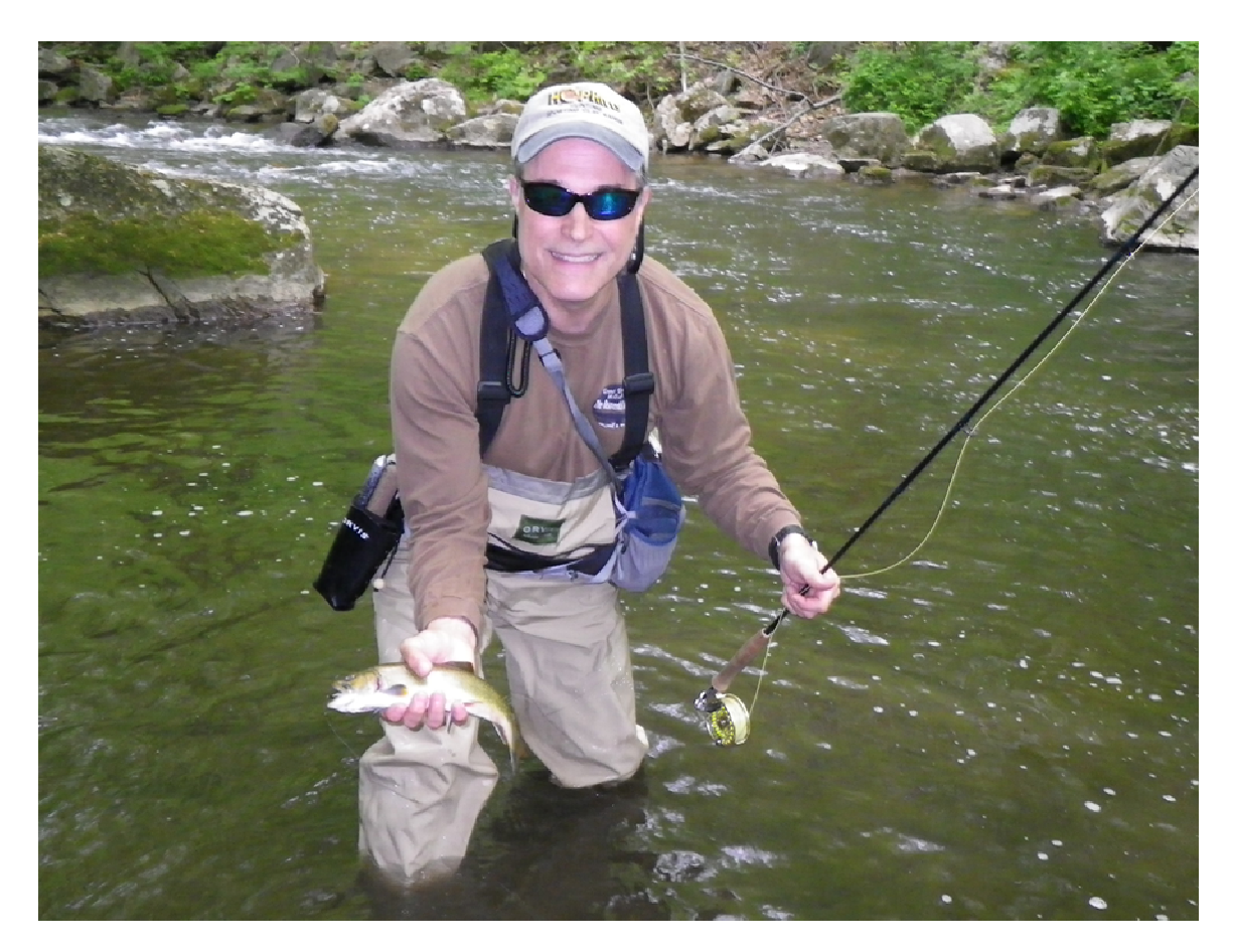
The author with a nice brookie caught on the "Sparkle Dace"

Pectoral Fins: Pale orange small hen feathers, coated with head cement and stroked to fuse th mounted on sides behind the head.