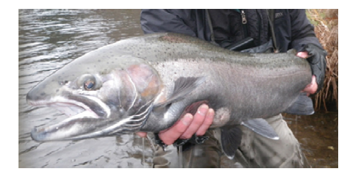
Salmon River Outfitters website is Salmon River Outfitters

We will stay at Salmon River Outfitters in Altmar, NY. The cost will be approximately $45.00 per night.