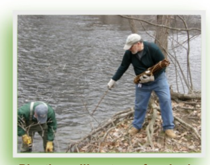
Planting willow trees for shade

We also participate in stream cleanup efforts, removing garbage and clutter from the water to aid in streams flows, and spreading woodchips in the parking areas for fishermen. In addition, we create better trout habitat through something called "Boulder propping", which is laying boulders on the stream bed on top of one another to create places for trout to rest and wait for food.