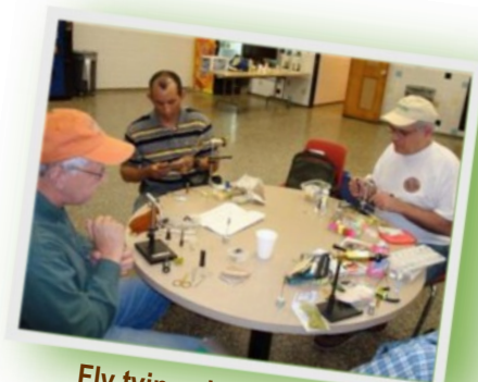
Fly tying class in Clifton