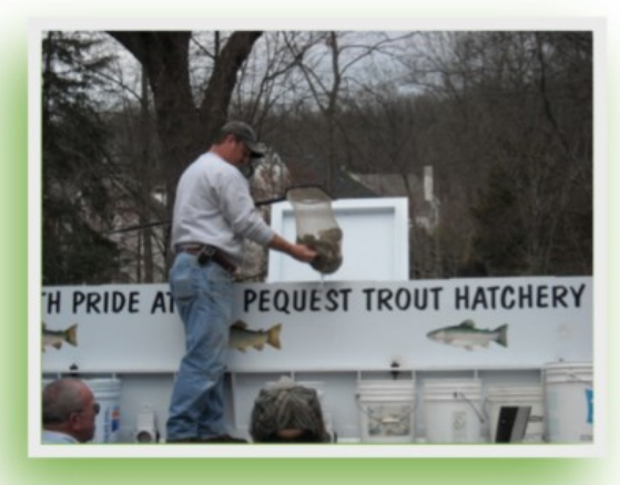
The hatchery truck arrives

value of your membership to our chapter. Make sure to bring your Trout Unlimited membership card with you and show it to the cashier when paying for your purchases.