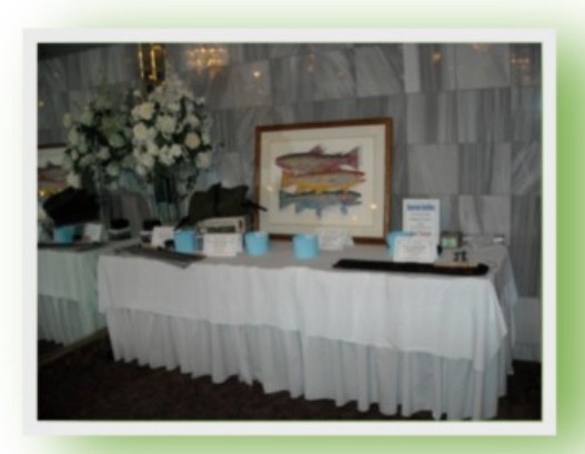
Some of the many raffle prizes

formal affair and generally includes spouses.