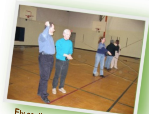
Fly casting instruction in Paramus

In this program, fertilized trout eggs are collected at the Pequest Hatchery and stored in cold-pack containers for transport.