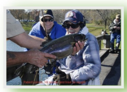
Success at the stream

Casting for Recovery® (CFR), a national 501(c)(3) non-profit organization, supports breast cancer survivors through a program that combines fly-fishing, counseling, and medical information to build a focus on wellness instead of illness.