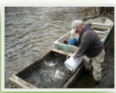
Preparing to float stock the Ramapo