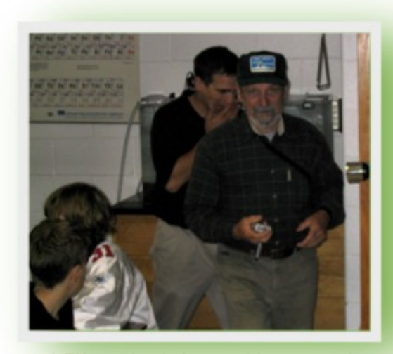
A TU member helps get things started