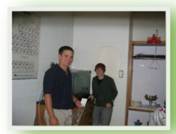
Setting up the tank in the classroom

Volunteer EJTU members take the eggs to select schools where they are deposited in aquariums environmentally suited for raising trout. In science classes, students study the environmental needs and life-cycle of the trout as they grow, which highlights issues such as water purity, temperature, and oxygenation. This is a fun and interesting way to teach students about the importance of environmental issues.