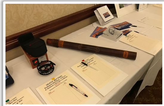
Raffles of Hand-Crafted and Luxury Items

Payment of $68.00 per person is due by March 10 th .