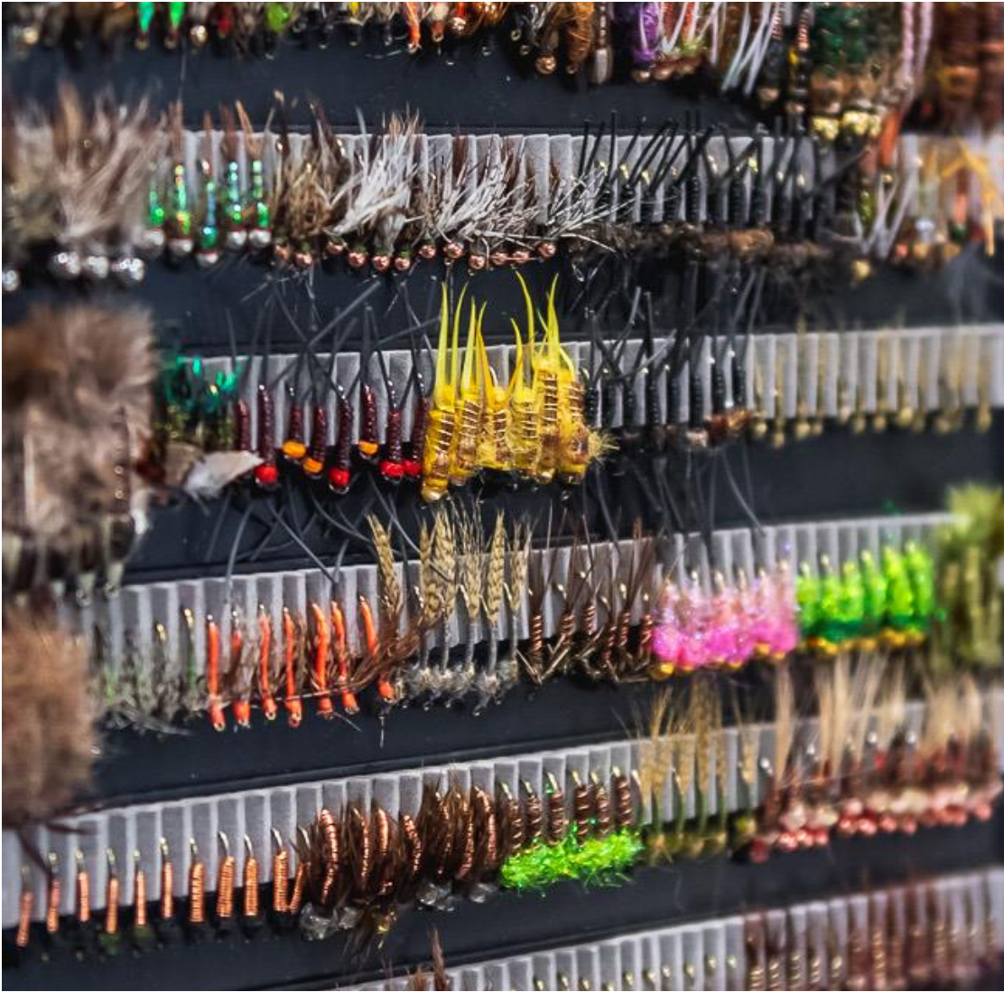
Photograph the Month: Greg Koch - "EJTU Nymph Box"