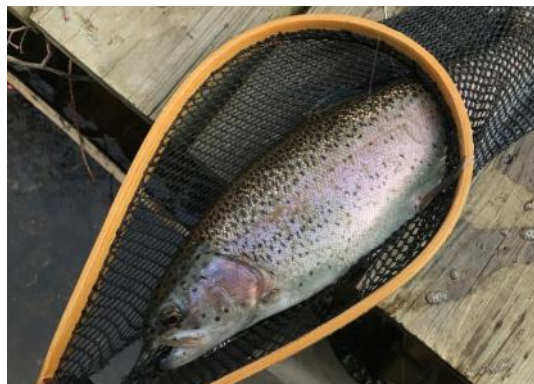
Typical Connetquot Rainbow Trout

We plan on having this popular trip again next year, so if you want to guarantee a spot on next year's trip, make sure you get involved with EJTU and volunteer at an event to earn some points. We guarantee you will have a great time volunteering and also fishing the Connetquot.