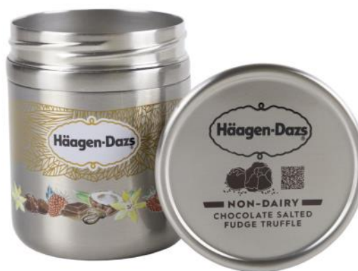
Reusable Ice Cream Containers. Pretty Cool!

Well, good news! Some of largest consumer product companies such as Nestle, PepsiCo and Proctor and Gamble are experimenting with pilot programs selling products such as orange juice, deodorant and ice cream in reusable glass bottles or metal containers.