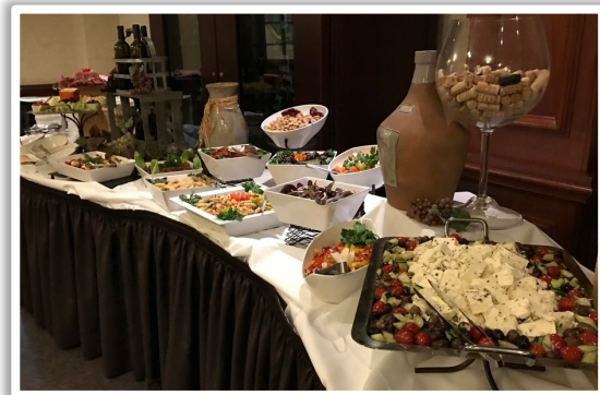
Gourmet Four Course Dinner and Cocktail Hour

If you cannot make EJTU's Banquet, please consider sending a donation in lieu of attending to support our mission of cold-water conservation.