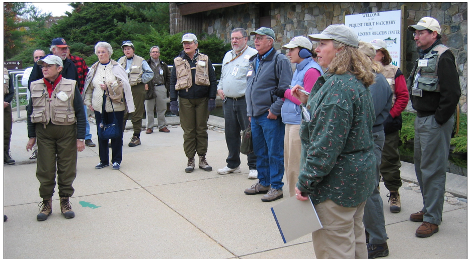
CFR retreat members, CRF Staff and EJTU volunteer instructors assemble prior to pairing off.

comes from learning a new skill and a connection to the natural environment. Casting for Recovery relies on donations for these retreats and EJTU was there to help. East Jersey made the funding grant possible and had a back-up check ready if needed and provided the volunteers. The first New Jersey Casting for Recovery retreat was a great success.